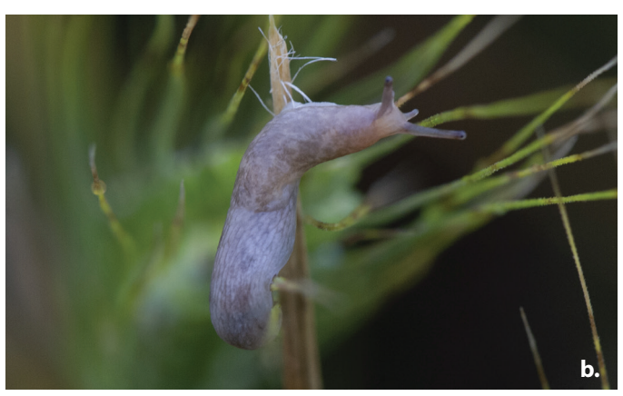
Figure 2. Grey field slugs: a) adult in BASF Ascot® 10 Nov and b) juvenile in RGT Accroc 11 Nov 2022.